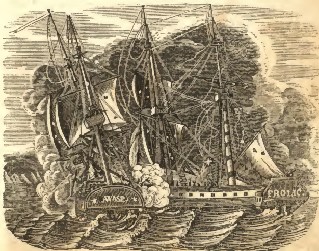
BATTLE OF THE WASP AND FROLIC.....COMMODORE JONES,